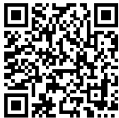
2014 ACA FLYER

MEMBERSHIP DUES ..... $15 per year ANNUAL MEETING ..... April